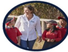
Build skills through fun